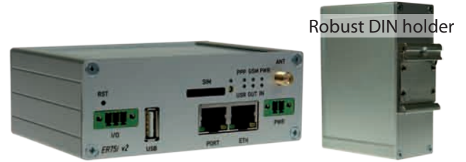
Version SL - metal housing