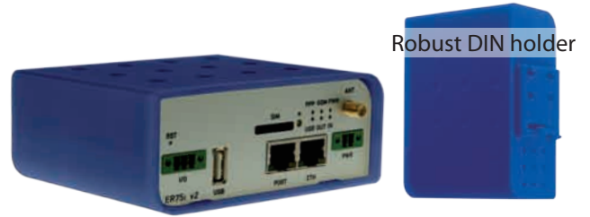
Version standard - plastic housing