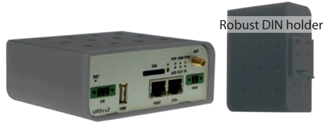
Version in plastic housing