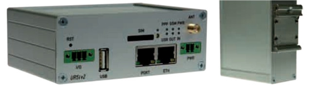
Version SL - metal housing